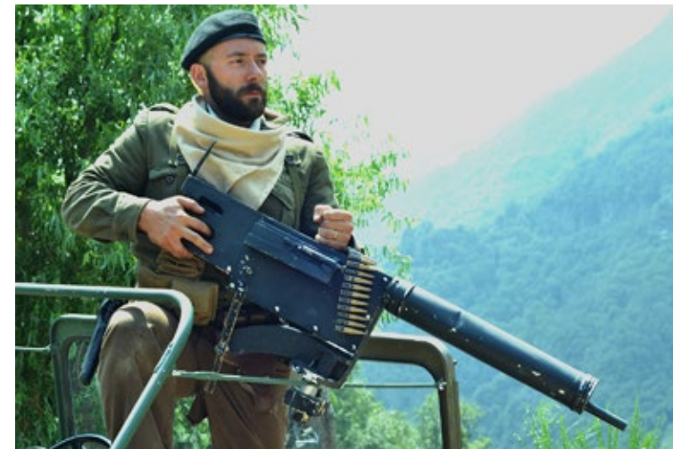
A soldier. I ribelli della montagna (in game).

cant content that could be grasped by the new generations of those who weren’t there.